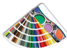
Choose from any RAL colour

Automatic barrier gates by AUTOGARD are not only efficient but also intelligent. With dual channel vehicle detector besides vehicle presence they are able to detect vehicle direction , which is extremely useful for vehicle counting .