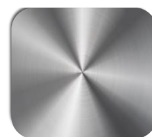
Stainless or powder coated steel